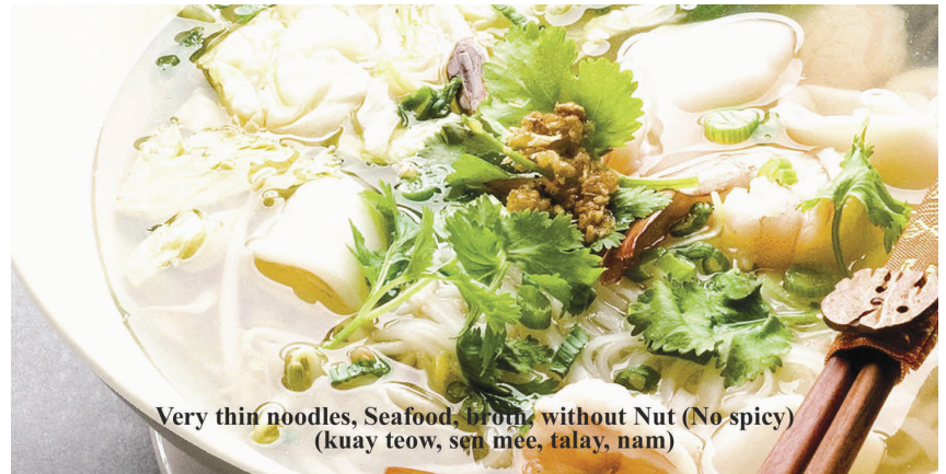
Very thin noodles, Seafood, broth, without Nut (No spicy) (kuay teow, sen mee, talay, nam)