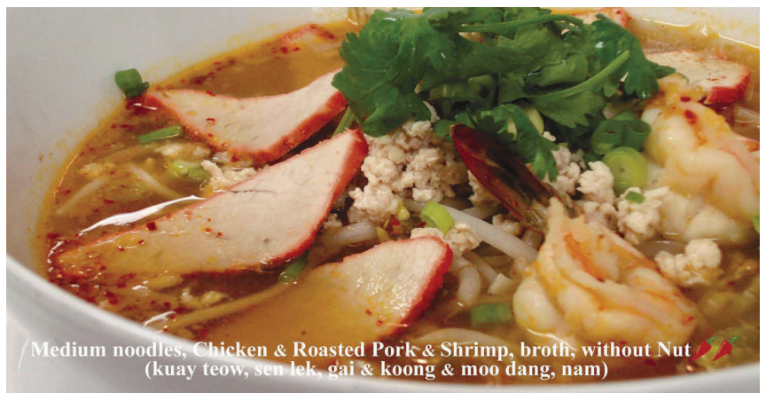
Medium noodles, Chicken & Roasted Pork & Shrimp, broth, without Nut (kuay teow, sen lek, gai & koong & moo dang, nam)

All your noodle come with Bean sprout Lettuce Scallion Cilantro Garlic oil